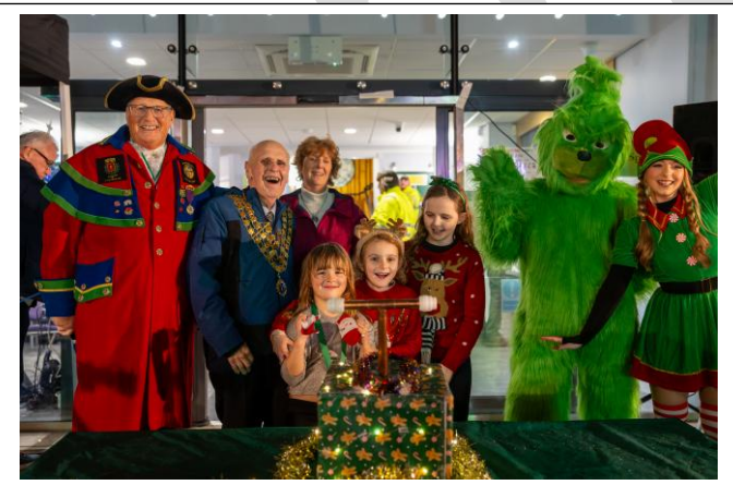
Christmas Lights Switch-on- November 2025