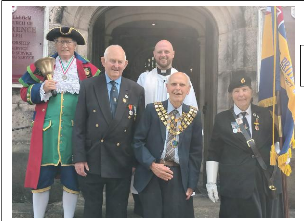
VJ Day at 80- August 2025