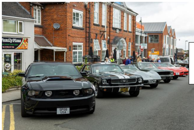
Classic Vehicle Show- September 2025