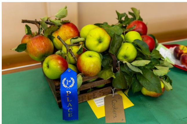
Homegrown and Handmade- September 2025