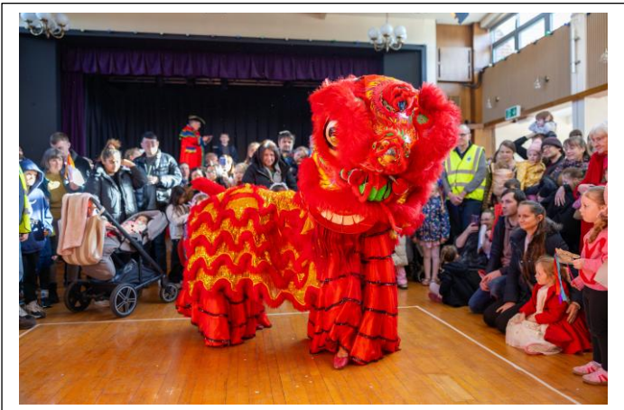
Chinese New Year- February 2026