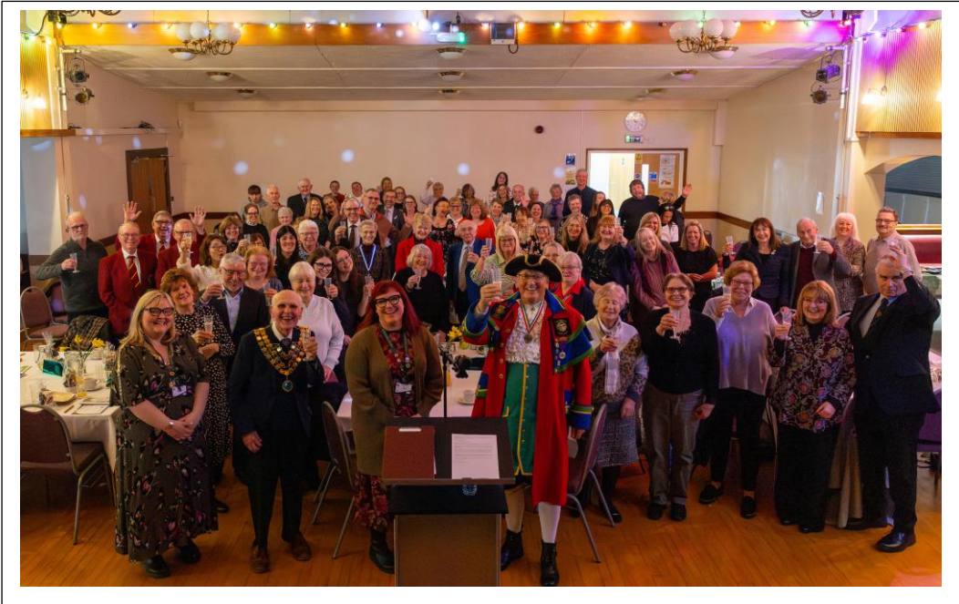
Volunteer Recognition and Civic Awards- February 2026