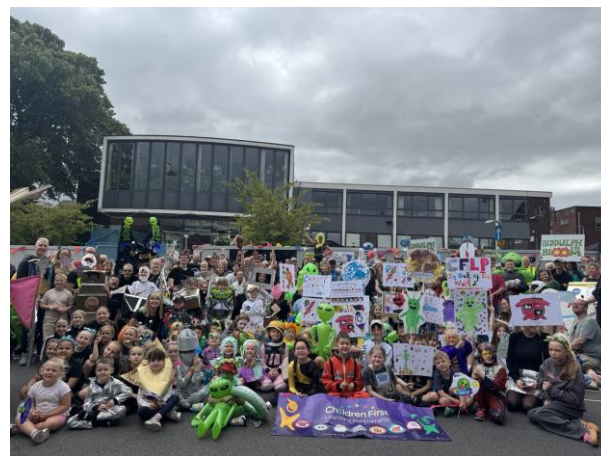
Festival Launch Day- July 2025

There have been so many incredible events during 2025-26. Here's just a selection of them: