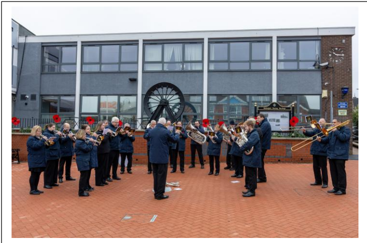
Remembrance Sunday- November 2025