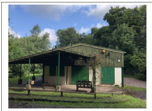
Biddulph Grange Country Park Visitor Centre

The area within the red box is managed by the Town Council.