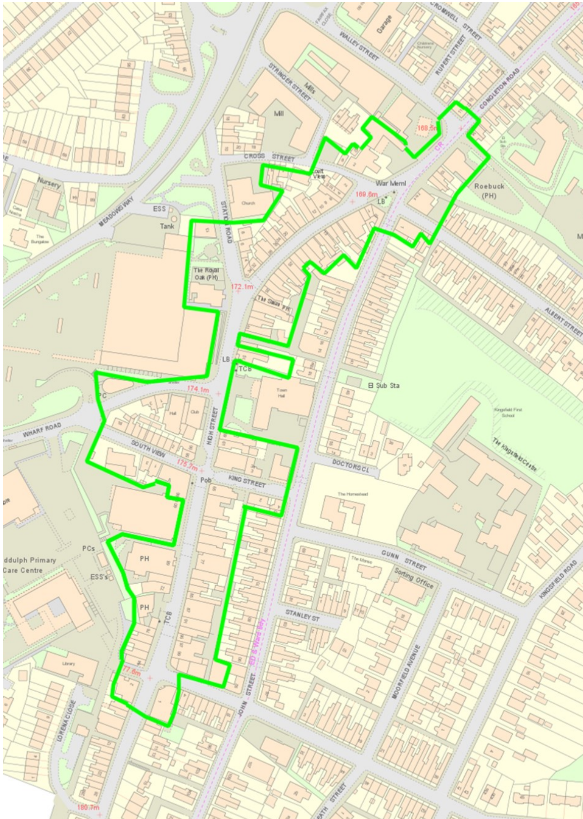
Plan 1 – The Area of Application of the Biddulph Neighbourhood Development Order (NDO) Not To Scale All buildings within the green line are included in the NDO Area.