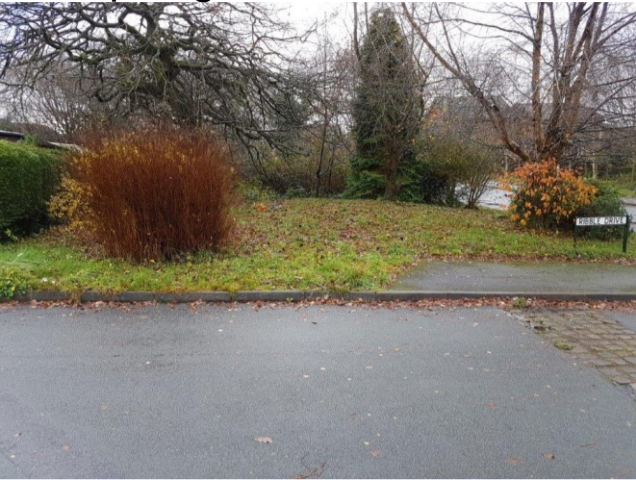
The open grassed area at the corner