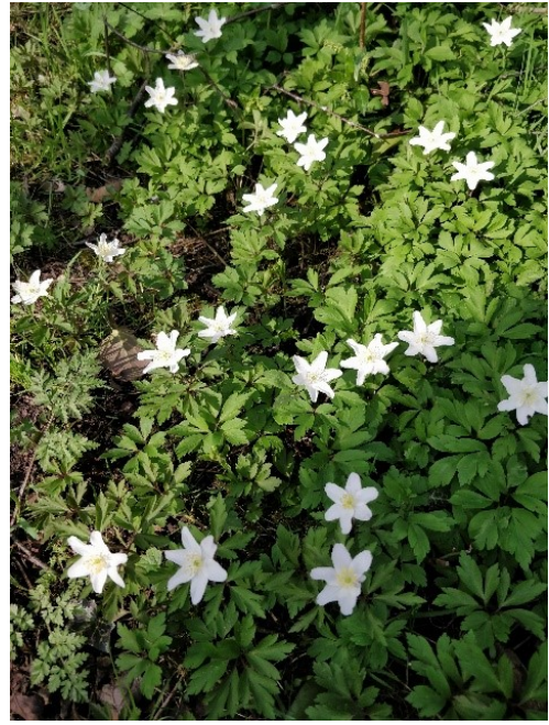
Wood Anenome along the Biddulph Valley Way