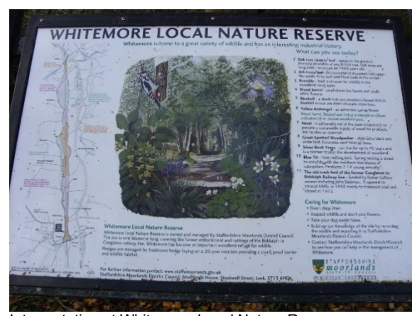
Interpretation at Whitemore Local Nature Reserve.