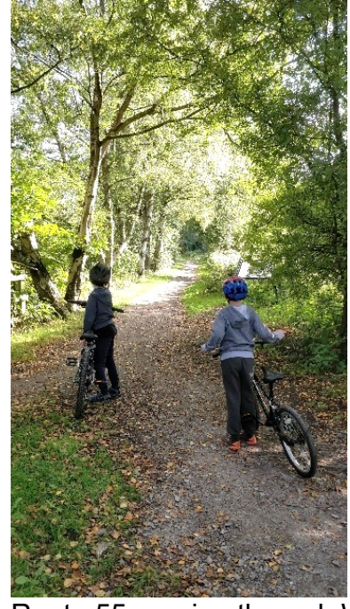
Route 55 running through Whitemoor Local Nature Reserve.