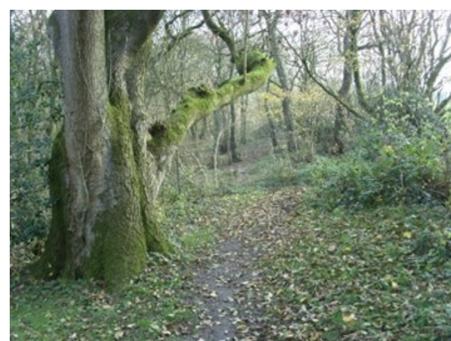
From Fold Lane