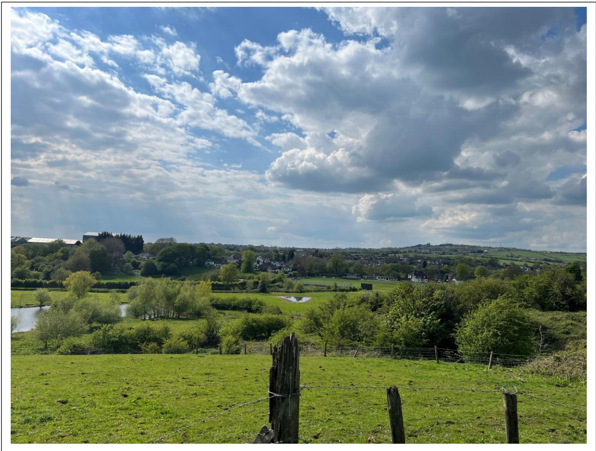
The view from Knypersley Hall towards Mow Cop

More information about Biddulph and our strategic direction can be found in the Five-Year Strategy.