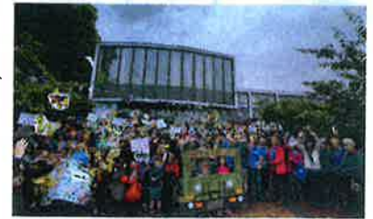
Festival launch & parade

We love being involved in the Biddulph Festival and supporting the activities both within the Town Hall and across the rest of the town. During the next few weeks, we will be busy with Town Council events. We're delighted that the first 'Biddulph's Got Soul' event is sold out. There will be a Family Cinema