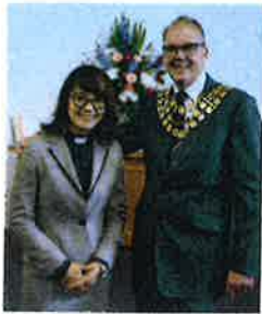
Mayor's Civic Service

We organised the Mayor's Civic Service, with guests from local community groups and visiting towns. We also hosted our first Prayer Breakfast with the members of Churches Together ST8.