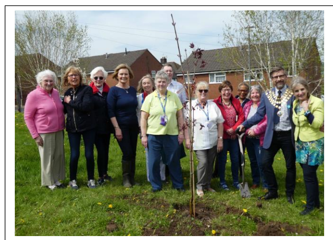
Tree planting with the U3A (above)