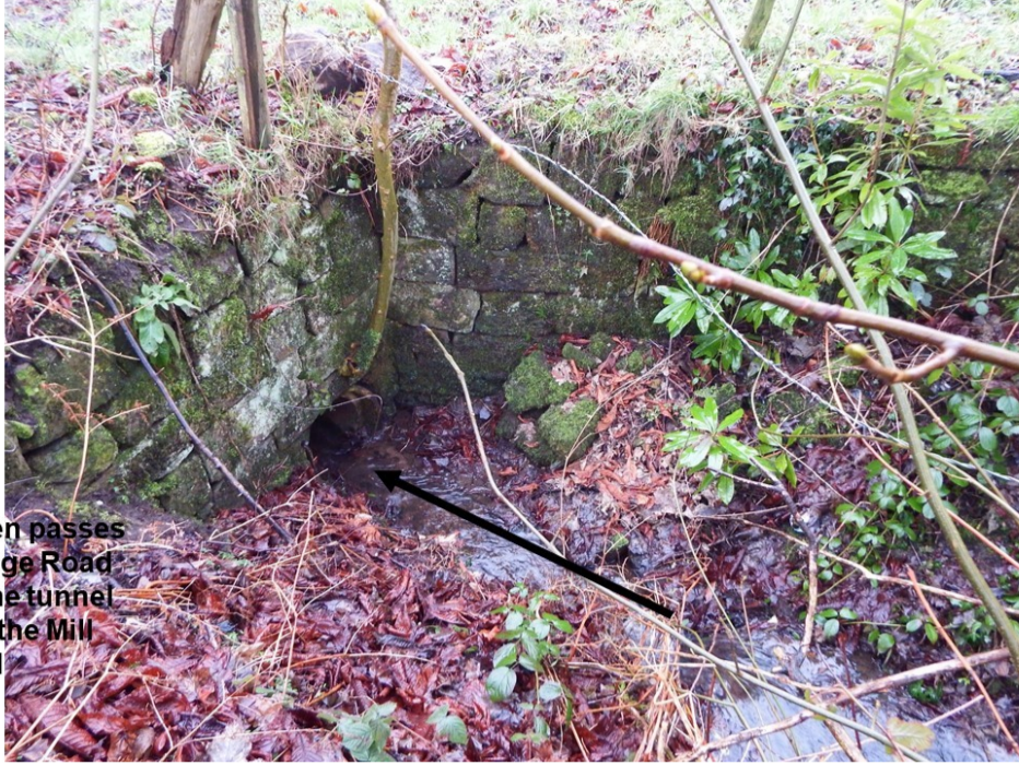
The leaf then passes under Grange Road via the stone tunnel and enters the Mill House Pool