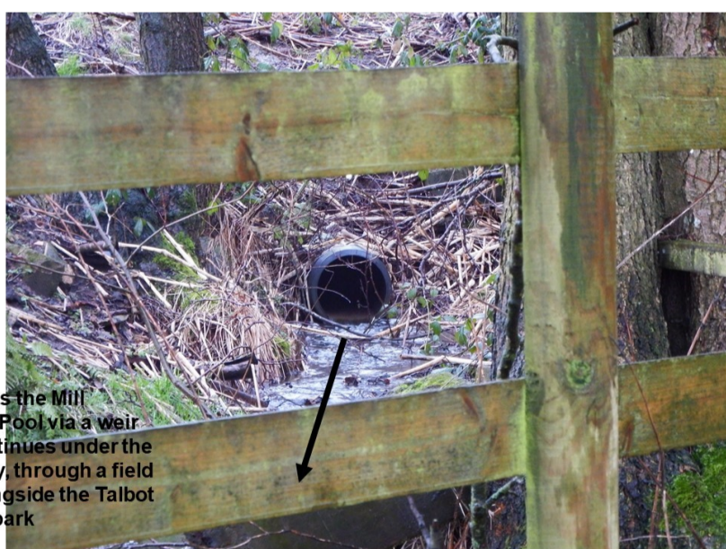
Leat exits the Mill Cottage Pool via a weir and continues under the driveway, through a field and alongside the Talbot pub carpark